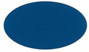
BERMUDA BLUE UC106661/5ML86922P PD500000