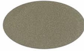
HARVEST GOLD PEARL UC106690F/5VMN86966P