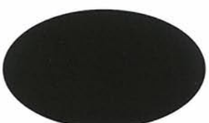
MINERAL BROWN METALLIC UC106715XL/3ZMN86994P