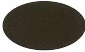
LEXUS BRONZE UC106698F/5VMN86974P