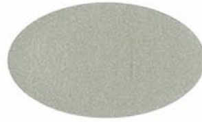
MOONDUST MICA UC106688F/5VMA86964P