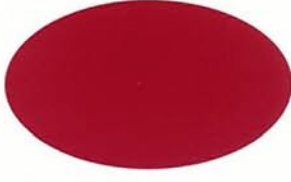
MARRAKESH RED UC106667XL*/3XMR86899P*