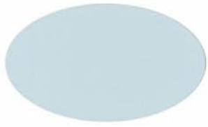
NEWPORT NEWS BLUE UC105743/5ML86769 PD500001