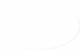
BRIGHT WHITE UC55026/5MW86849 PD800001