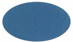
BREAKWATER BLUE MICA UC106665F/5VML86979P

UC Code = Extrusion Code Number 5VM Code = Coil Code Number