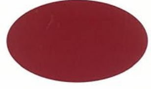
ROASTED RED PEPPER UC102320XL*/3XMR86927*