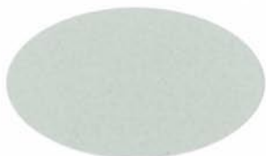
METALLIC MIST UC106703XL/3ZMA86980P