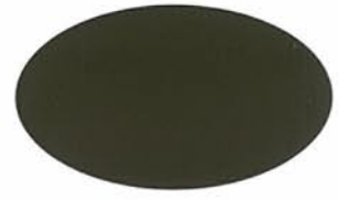
COCOA BEAN UC105735/5MN86924 PD200010