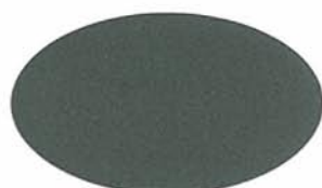
MEDIUM GRAY Classic UC51595XL/3ZMA86440P