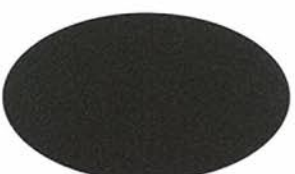
VINTAGE BRONZE UC106714XL/3ZMN86993P