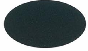
COSMIC GRAY MICA UC106686F/5VMA86961P