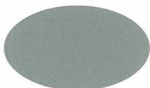
SILVER GRAY Classic UC50958XL/3ZMA86715P