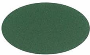
FRESCO GREEN PEARL UC106701F/5VMG86977P