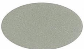
FAWN METALLIC UC106710XL/3ZMN86988P