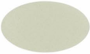
MANHATTAN BEIGE PEARL UC106687F/5VMN86962P