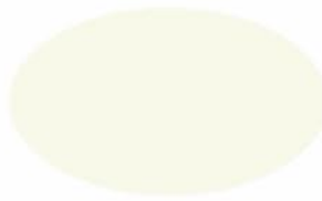
CANDLELIGHT BEIGE UC96693/5MW86845 PD800002