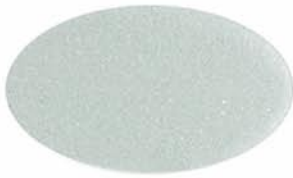
SUNLIGHT SILVER UC106681F/5VMA86954P