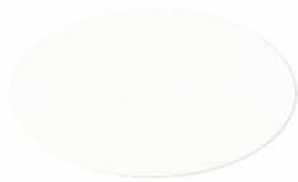
BONE WHITE Classic UC43350/5MW86823 PD800000