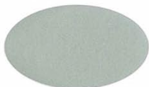
CHAMPAGNE GOLD Classic UC51568XL/3ZMA82897P