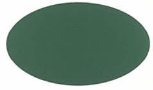
URBAN MIST GREEN UC106679/5MG86920 PD400003