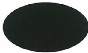
DARK BRIAR MICA UC106694F/5VMN86970P