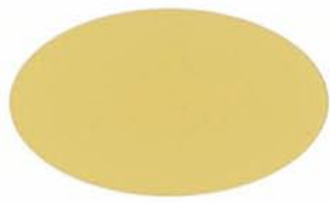
SESAME SEED UC105742/5MY86898 PD300001