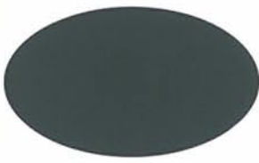
ECLIPSE GRAY UC106669/5MA86799 PD900000