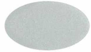
RENAISSANCE SILVER UC106663F/5VMA86957P