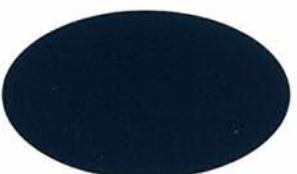
MIDNIGHT BLUE ICE UC106723LB*/3ZML87002P

UC Code = Extrusion Code Number 3ZM/4ZM Code = Coil Code Number