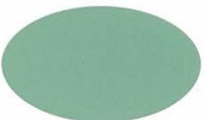
SILVER SAGE METALLIC UC106720XL/3ZMG86999P