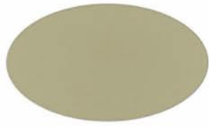
PORTABELLO UC105733/5MN86918 PD200008