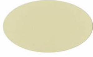
CARAMEL LATTE UC105737/5MI86798 PD200002