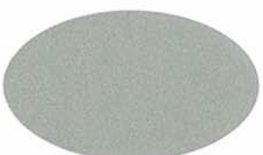
ICED CAPPUCCINO UC106713XL/3ZMN86991P