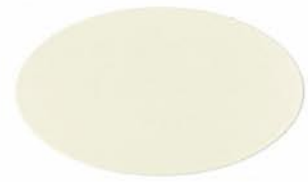
NATURAL WICKER UC105747/5MI86860 PD200006