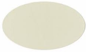
MALT UC105738/5MI86783 PD200007