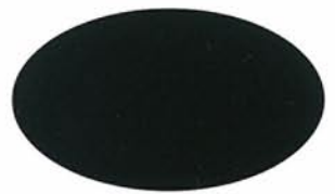
CAFÉ NOIR PEARL UC106695F/5VMN86971P