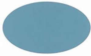
BAYVIEW BLUE UC106660/5ML86929 PD500002