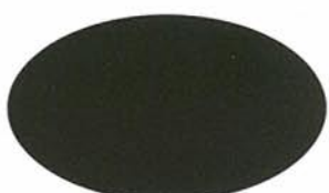
CHOCOLATE BRONZE UC106709XL/3ZMN86986P