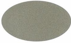
CHAMPAGNE BRONZE Classic UC70202F/5VMN82395P