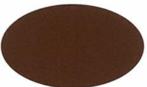
COPPER CANYON UC106718XL/3ZMN86997P