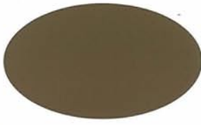
BUCKHEAD BROWN UC105734/5MN86923 PD200009