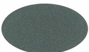
SILVER SHADOW UC106707XL/3ZMA86984P