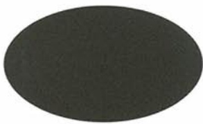
BISTRO BRONZE UC106693F/5VMN86969P