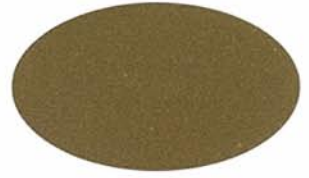
ROMAN BRONZE MICA UC106691F/5VMN86967P