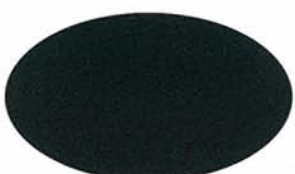
GRAPHITE GRAY UC106708LB*/3ZMB86985P