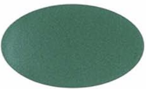
PACIFIC SPRUCE MICA UC106700F/5VMG86976P