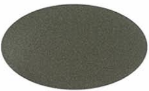
DRIFTWOOD MICA UC106692F/5VMN86968P