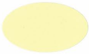
BUTTERSILK UC106670/5MY86944 PD300000