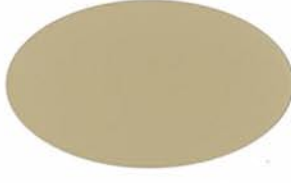
ADOBE UC105740/5MN86841 PD200003