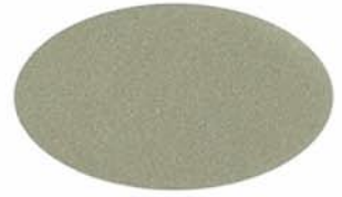
CASHMERE PEARL UC106689F/5VMN86965P