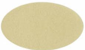
EARTHEN GOLD UC106716LB*/4ZMY86995B*