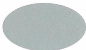
SILVER Classic UC51131XL/3ZMA86386P