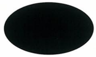
BLACK Classic UC40577/5MB86928 PD900001

UC Code = extrusion (liquid) code number 5M/3XM Code = coil (liquid) code number PD Code = extrusion (powder) code number