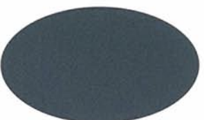
OXFORD BLUE METALLIC UC106722LB*/3ZML87001P