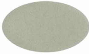
NATURAL SUEDE MICA UC106666F/5VMA86963P