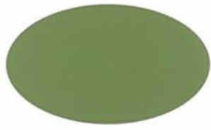
ECO-GREEN UC105755/5MG86919 PD400001