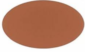
CLAYPOT UC105746/5MR86782 PD600000