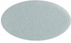
GALAXY SILVER UC106683F/5VMA86958P