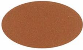
LIQUID COPPER MICA UC106697F/5VMR86973P