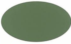
GLADE GREEN UC105745/5MG86770 PD400002