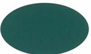
SEA MIST GREEN UC106721XL/3ZMG87000P