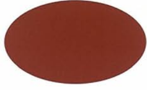
CHIPOTLE UC106668/5MR86840 PD600001