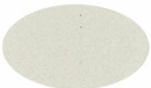
VANILLA SAND UC105757VL**/3ZMI86987P