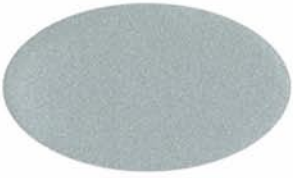
SILVERSMITH Classic UC70092F/5VMA86003P