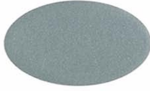
SATIN NICKEL UC106684F/5VMA86959P