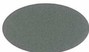
PEWTER Classic UC51713XL/3ZMA86280P