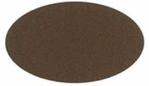
HAZELNUT MICA UC106699F/5VMR86975P