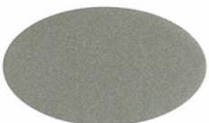
AUTUMNWOOD METALLIC UC106711LB*/3ZMN86989P