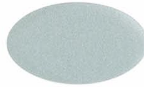
STERLING SILVER UC106662F/5VMA86956P