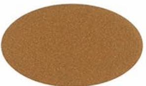
CINNAGOLD DUST UC106717XL/3ZMR86996P