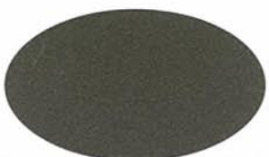
SUMMER SUEDE METALLIC UC106712XL/3ZMN86990P