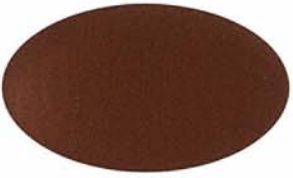
RUSSET PEARL UC106696F/5VMR86972P