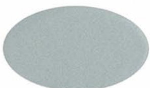
WHITE ICE METALLIC UC106706XL/3ZMA86983P