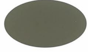
FAIRVIEW TAUPE UC105741/5MN86754 PD200005