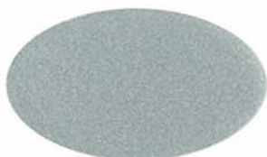
STEEL-CITY SILVER UC106705XL/3ZMA86982P